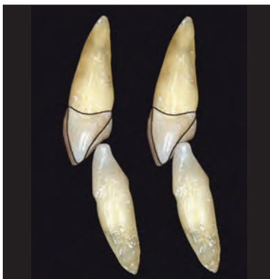
Figure 11 Significant equilibration of the labial and palatal crown surfaces is often required.

lateral contours. 2,8 The color of the natural canine should also be addressed and should approximate that of the central incisor (Figure 6). However, it is not uncommon for the canine to be more saturated with color, resulting in a tooth that is one to two shades darker than the central incisor. The most conservative way to correct the color difference is to individually bleach the canine. If this fails to approximate the desired color, a veneer may be indicated.