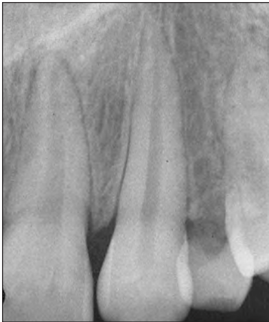
Figure 7 Radiographic evaluation of crown width at the CEJ.