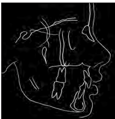
Figure 4 A mildly convex profile may also be acceptable.

The shape and color of the canine are important factors to consider for canine substitution to be considered esthetic. Naturally, the canine is a much larger tooth than the lateral incisor it is replacing. With a wider crown and a more convex labial surface, a significant amount of reduction is often required for the orthodontist to achieve a normal occlusion and acceptable esthetics (Figure 5). If a significant amount of enamel must be removed to establish proper surface contours, the underlying dentin may begin to show though the thin enamel, thereby decreasing the esthetics. 7 In a canine with a greater degree of labial convexity, dentin exposure can occur leading to the need for restorative intervention. Depending on the amount of incisal edge wear of the canine, it may be necessary to restore the mesioincisal and distoincisor edges to recreate normal