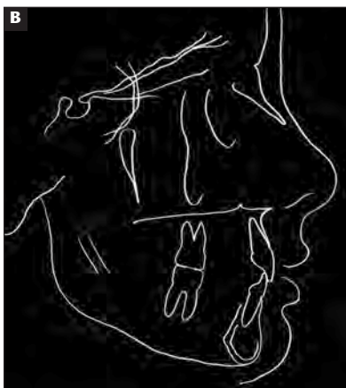
Figure 3A and Figure 3B A balanced facial profile is ideal.

Generally, the treatment of choice should be the least invasive option that satisfies the expected esthetic and functional objectives.