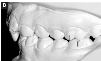
Figure 2A and Figure 2B Maxillary canines erupting into the edentulous lateral incisor position (A). Class II molar relationship in canine substitution patients (B).