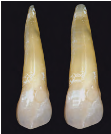
Figure 8 A narrow width at the CEJ produces a more esthetic emergence profile.