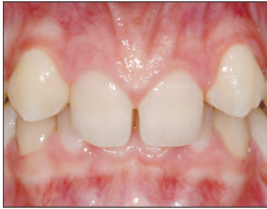
Figure 6 The color of the canine and central incisor crowns should match.