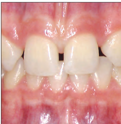
Figure 10 The canine root eminence may be prominent.