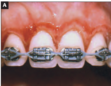
Figure 9A and Figure 9B Gingivectomy reestablishes proper gingival margin contours (A). One month post-gingivectomy demonstrates nice gingival architecture (B).