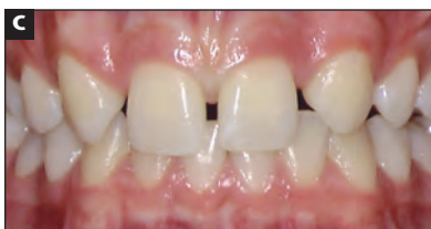
Figure 1A through Figure 1C Evaluation of specific dental and facial criteria is necessary when selecting the appropriate patient for canine substitution.