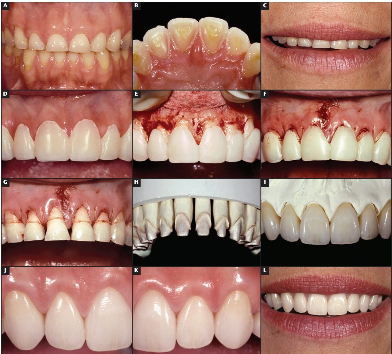
Figure 4 This woman had short maxillary incisors ( A ) and significant lingual erosion of these teeth ( B ) due to bulimia. The amount of incisal edge visible at rest was about 2 to 3 millimeters ( C ). Since the maxillary incisal edge was positioned appropriately relative to the posterior occlusal plane and her upper lip, tooth length was increased with osseous surgery. A surgical guide with proper tooth proportion ( D ) allowed the periodontist to establish the desired bone ( E ) and gingival levels ( F,G ). By increasing the crown length, adequate ferrule was available ( H ) to create esthetically proportional anterior restorations ( I ). In spite of significant crown lengthening, the tissue health after restoration was satisfactory, and the gingival margins were located properly ( J,K ), which enhanced the patient's smile.