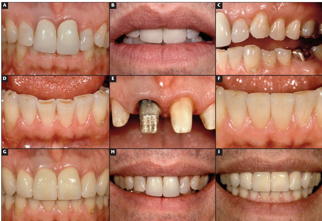
Figure 1 This man was concerned about the esthetic appearance of his maxillary anterior teeth ( A ). At rest, he showed about 4 millimeters of maxillary incisal edge ( B ). In protrusive position, he had more than sufficient incisal length to disclude the posterior teeth ( C ). Because of a protrusive bruxing habit, his mandibular incisors were worn and positioned apical to the posterior occlusal plane ( D ). The gingival margins were located correctly and the preparations had adequate ferrule ( E ). Therefore, the maxillary incisors were shortened to facilitate restoration of the mandibular incisors ( F ) and the maxillary incisors ( G ). Because the treatment was planned using esthetic principles, it was possible to improve the esthetic proportions of the teeth ( H : before; I : after).

dentitions simply cannot be restored to a more esthetic appearance without the assistance of several different dental disciplines. Today, every dental practitioner must have a thorough understanding of the roles of these various disciplines in producing an esthetic makeover, with the most conservative and biologically sound interdisciplinary treatment plan possible.