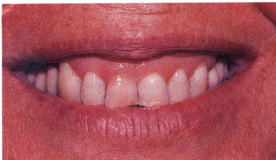
Figure 2A —This patient had a “gummy smile” and short, abraded maxillary central incisors from a protrusive bruxing habit.