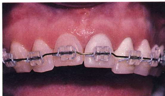
Figure 3C —Gingival levels were aligned instead of the incisal edges. The left lateral incisor was extruded and equilibrated, and the central incisors were intruded.