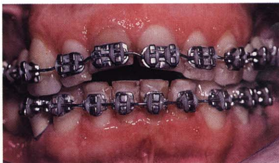
Figure 2B —To create space that would allow lengthening of the central incisor crowns, the patient's maxillary incisors were intruded orthodontically.