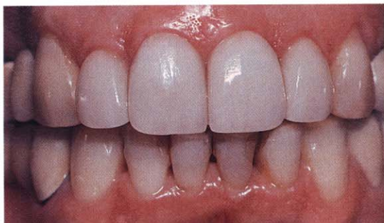
Figure 2C —Tooth intrusion permitted construction of longer and more esthetically shaped central and lateral incisor crowns.