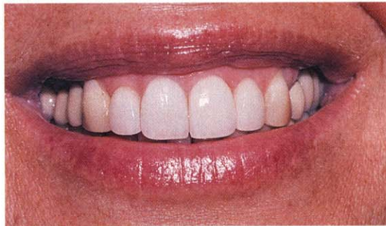
Figure 2D —The orthodontic-restorative treatment eliminated the patient's “gummy smile.”