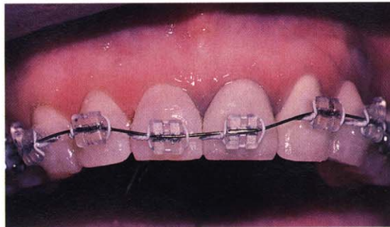
Figure 3B —To align gingival levels before reconstruction of the bridge, orthodontic brackets were intentionally placed in unusual positions.